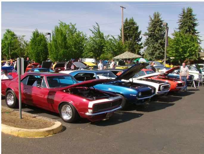
At the Bethel Boosters Car show and shine, I was lucky the Camaros had their own category.