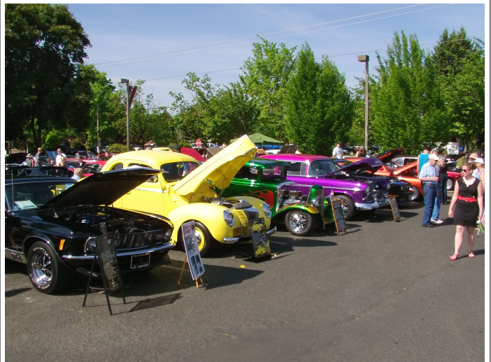
Beautiful day, beautiful cars.