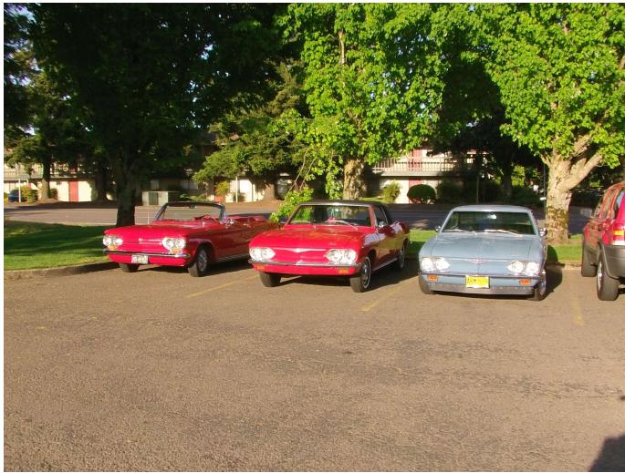
May's meeting at Sizzler in Springfield. Rex was there too, but no space next to ours. Mine is LOW.