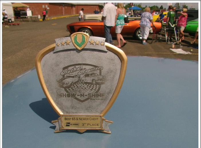
It's all good though, got the trophy.