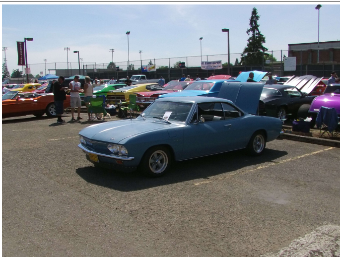
Nobody parked next to me, maybe it was going to flip over, blow up and suffocate everyone?